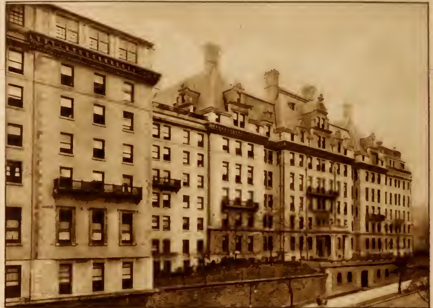
WOMAN'S HOSPITAL, 110th Street and Amsterdam Avenue.